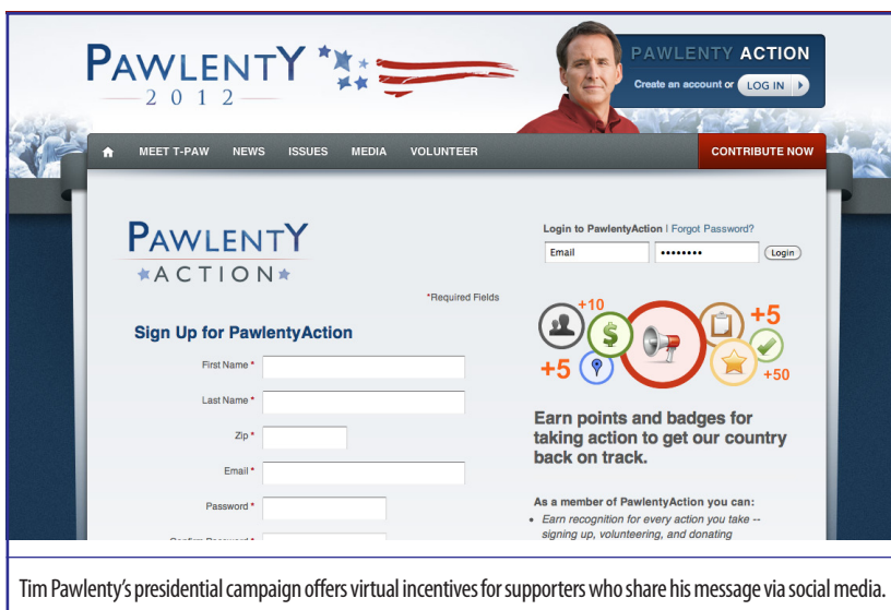
Tim Pawlenty’s presidential campaign offers virtual incentives for supporters who share his message via social media.

For campaigns to make the most of their investment in an online presence, they must provide opportunities for engagement. These opportunities could be as simple as including links to Facebook and Twitter and as sophisticated as providing an Electronic Press Kit about the candidate. The press kit can easily be forwarded with a personalized message by supporters who want to recruit friends to the cause. Tools like Facebook Connect offer easy opportunities for campaigns with limited resources to include interactive elements on their sites while simultaneously enhancing their Facebook presence.