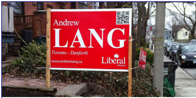
Candidates are integrating QR codes into printed campaign materials.

Foursquare badge for participants in a one-day fundraising event in Las Vegas. 21