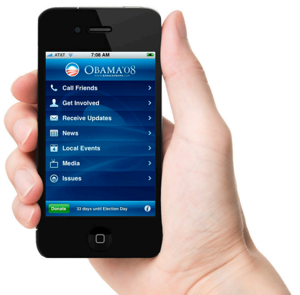
The Obama for America campaign created an app to allow iPhone users to easily connect with the campaign in the 2008 election cycle.

In 2012, mobile communications will play an even more important role in political campaigns. Mobile communications make it possible to combine real-world experiences with online interactivity. The growing use of Quick Response (QR) codes merges these worlds. Smartphones that are equipped to read QRs allow users to instantly “check in” to an event via Foursquare or Facebook. Because Foursquare automatically links to Facebook and Twitter accounts, users who scan a QR code provide a mutually beneficial exchange when they do so: the user gets to announce to friends and followers that he is at a hip political event, and the organizers of that event are able to gather information from him in return.